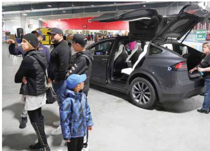
▲ People inspected many kinds of electric vehicles at the April 22 Race to Net Zero event that was held at Acton Arena and Community Centre.