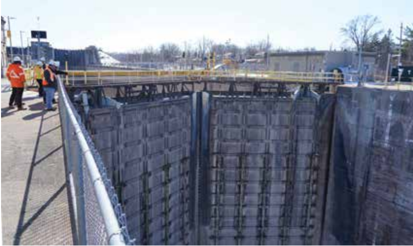
▲ On March 9, after part of the Welland Canal had been drained of water for extensive maintenance work, Lock 5 was made available for some people to have a rare, behind-the-scenes tour.